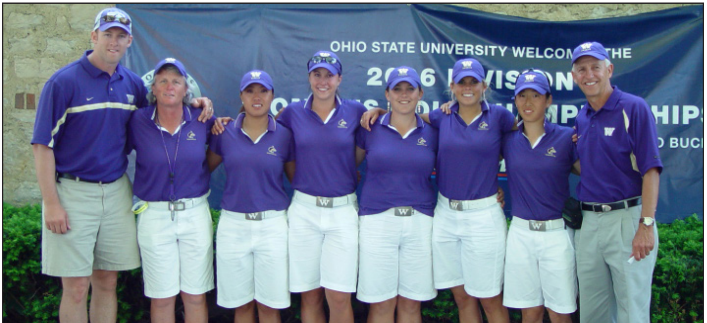
The 2006 Huskies finished sixth at the NCAA championship, equaling the best finish ever in UW history.